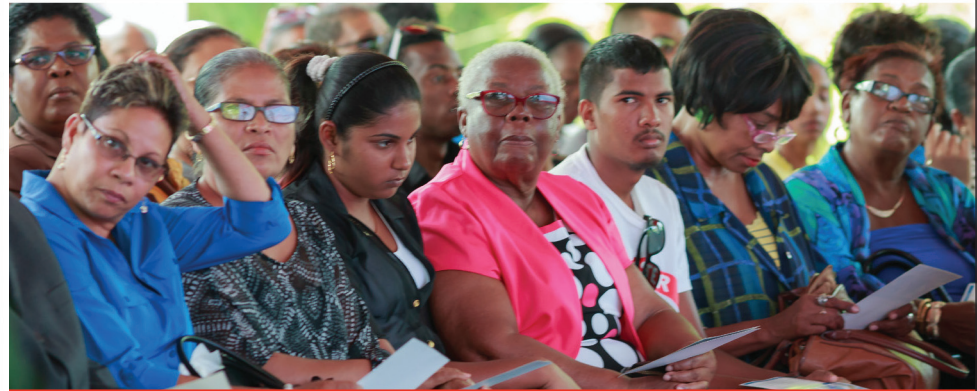
A cross section of the audience listens attentively during the official opening ceremony of the La Brea Police Station.