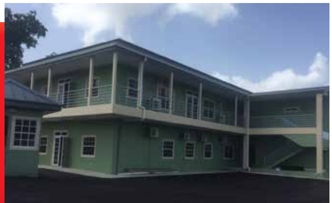
LAS LOMAS #2 COMMUNITY CENTRE