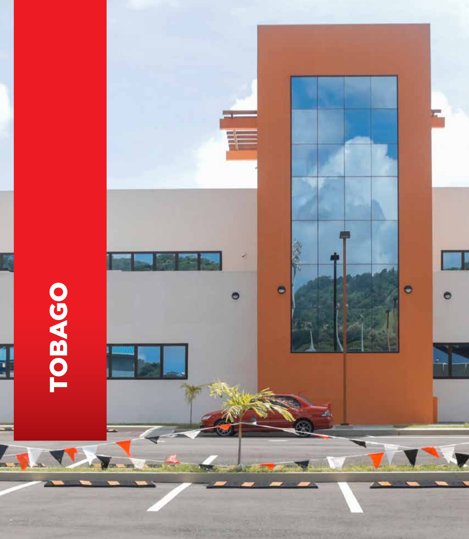
Roxborough Administrative Complex, Tobago