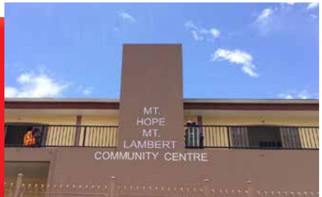
MT. HOPE/MT. LAMBERT COMMUNITY CENTRE