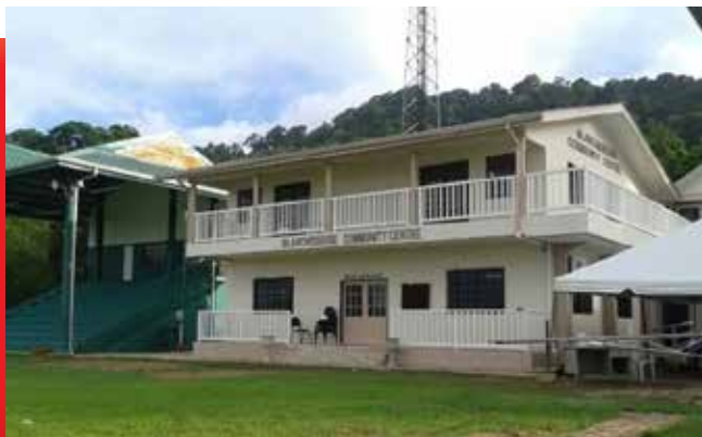
BLANCHISSEUSE COMMUNITY CENTRE