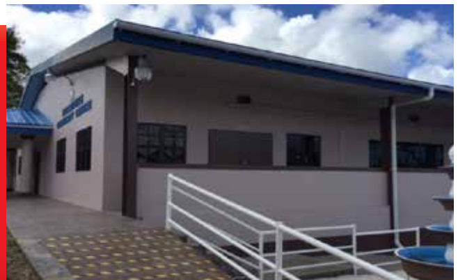
PLEASANTVILLE COMMUNITY CENTRE