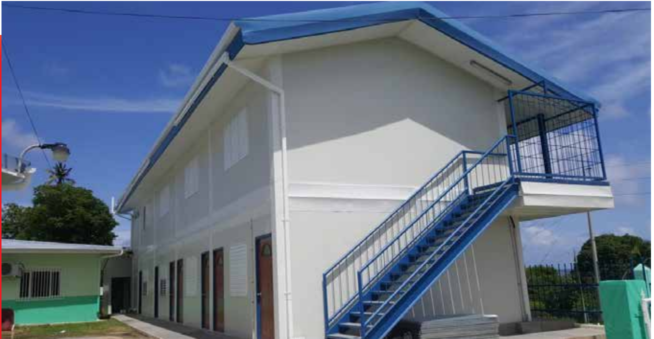
HOPE PRIMARY SCHOOL