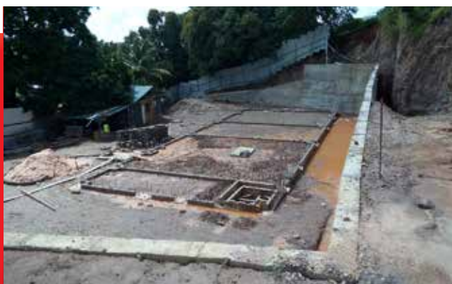
MAITAGUAL COMMUNITY CENTRE