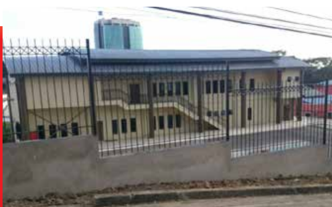
SAN FERNANDO NORTH COMMUNITY CENTRE