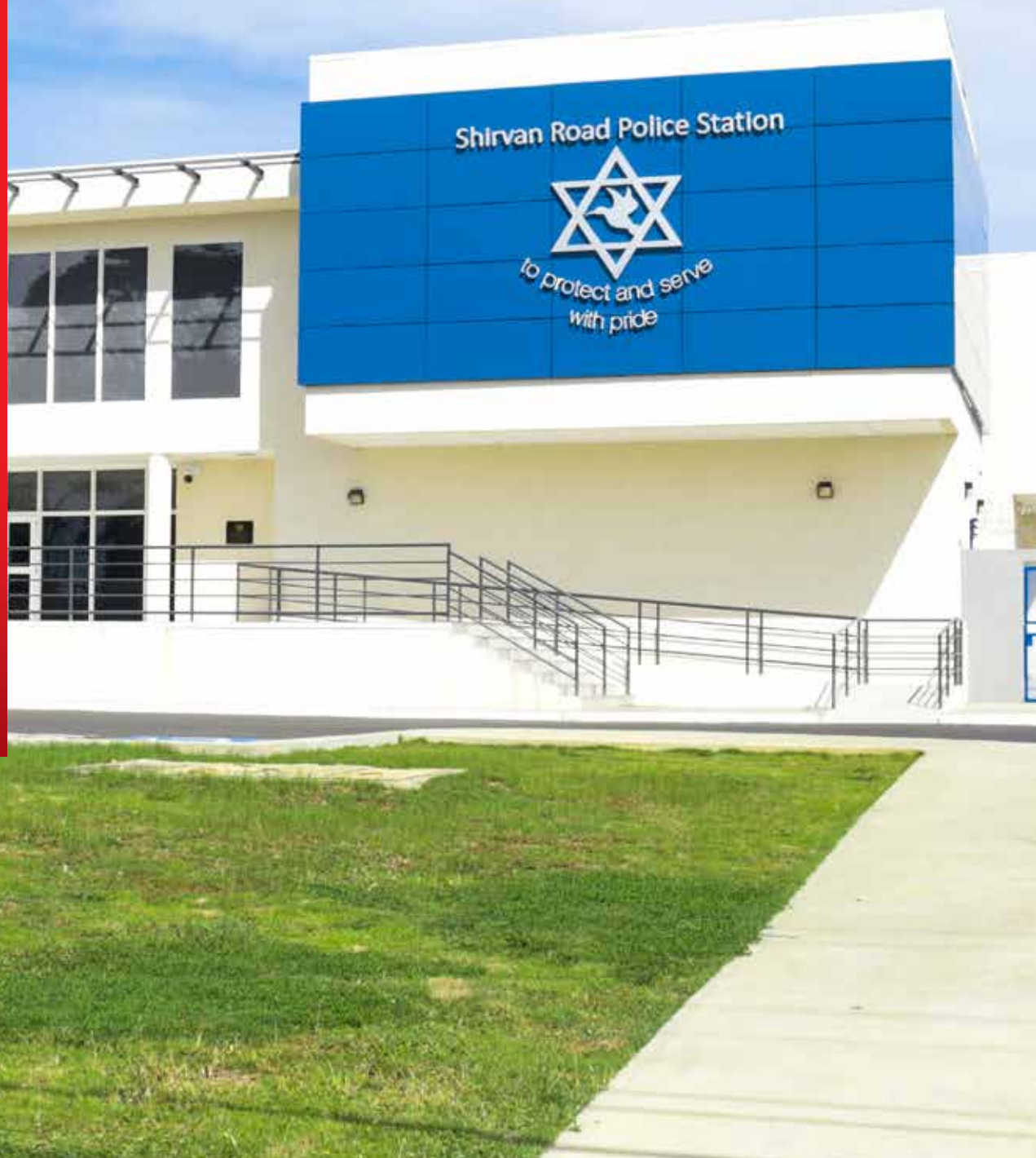
Shirvan Road Police Station, Tobago COMPLETED MAY 2019