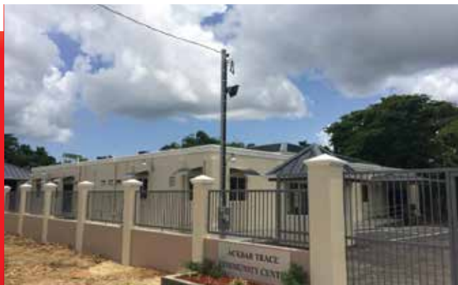
ACKBAR TRACE COMMUNITY CENTRE