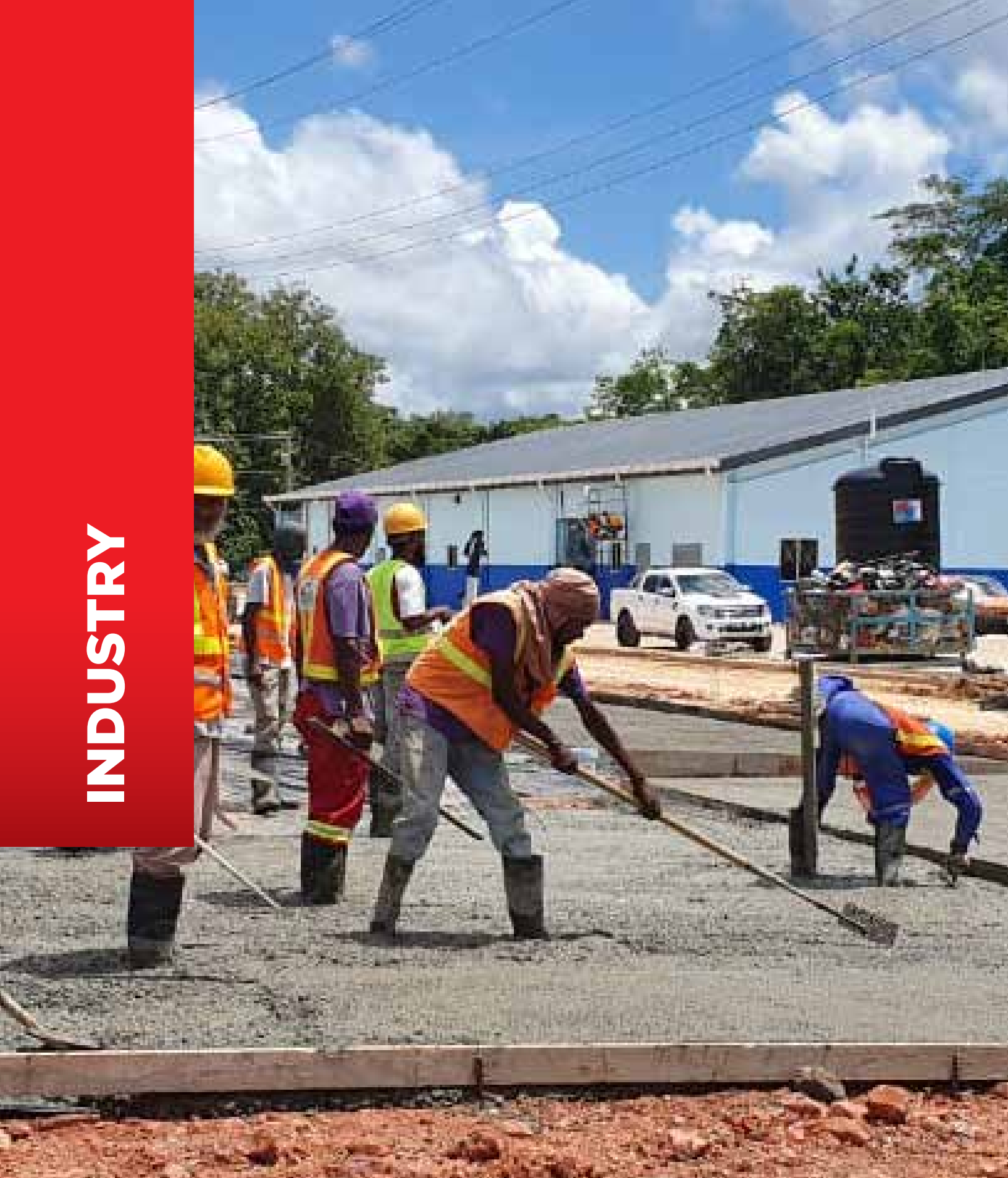
MORUGA AGRO-PROCESSING AND LIGHT INDUSTRIAL PARK