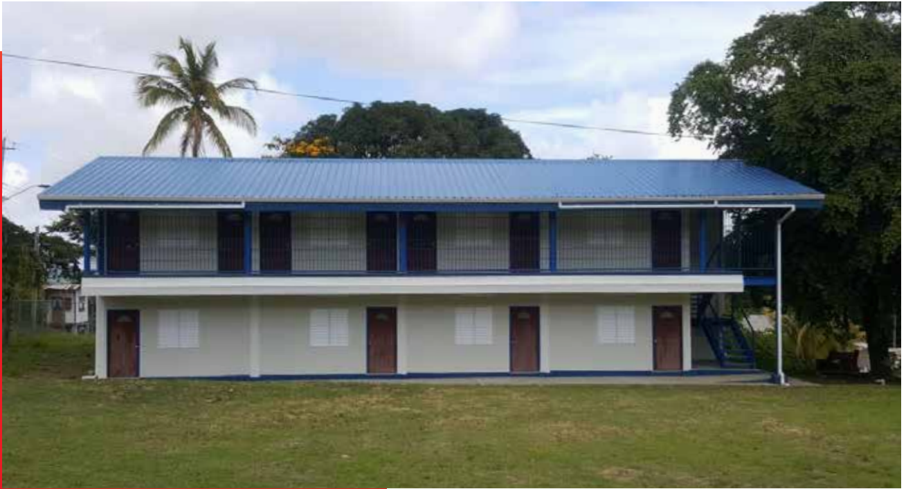
PATIENCE HILL PRIMARY SCH