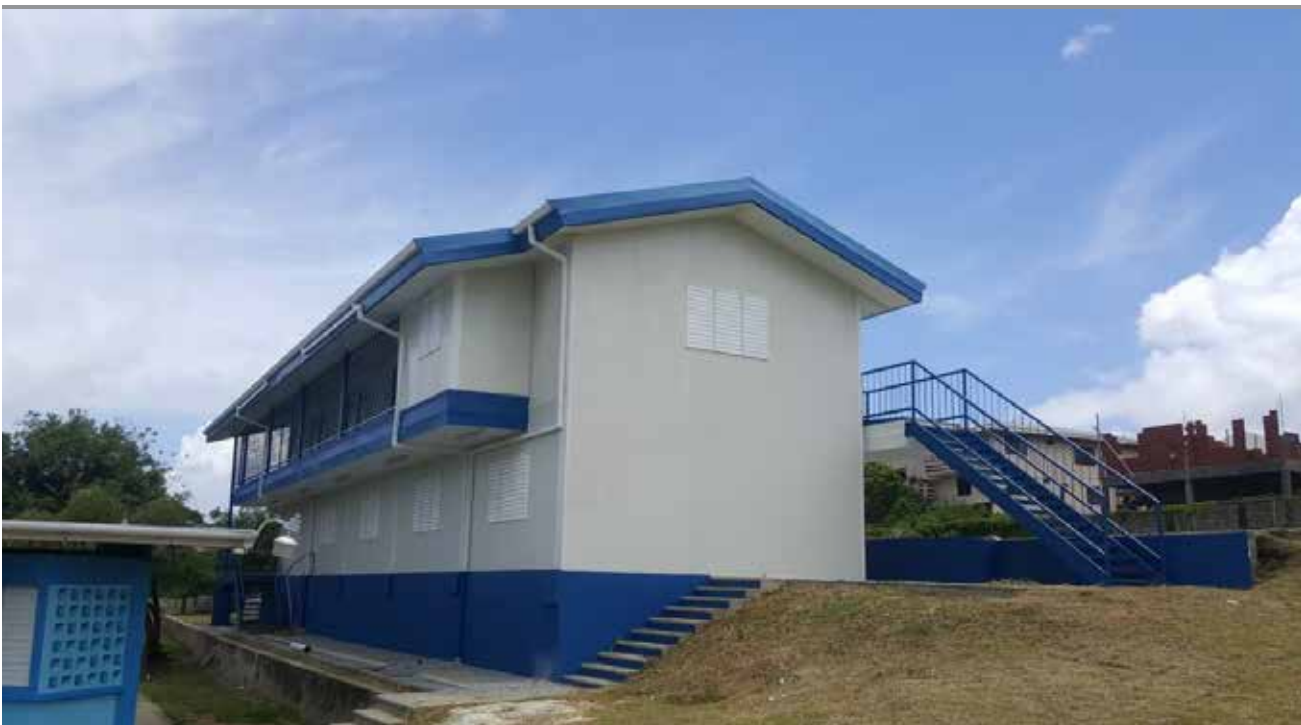
SIGNAL HILL PRIMARY SCH