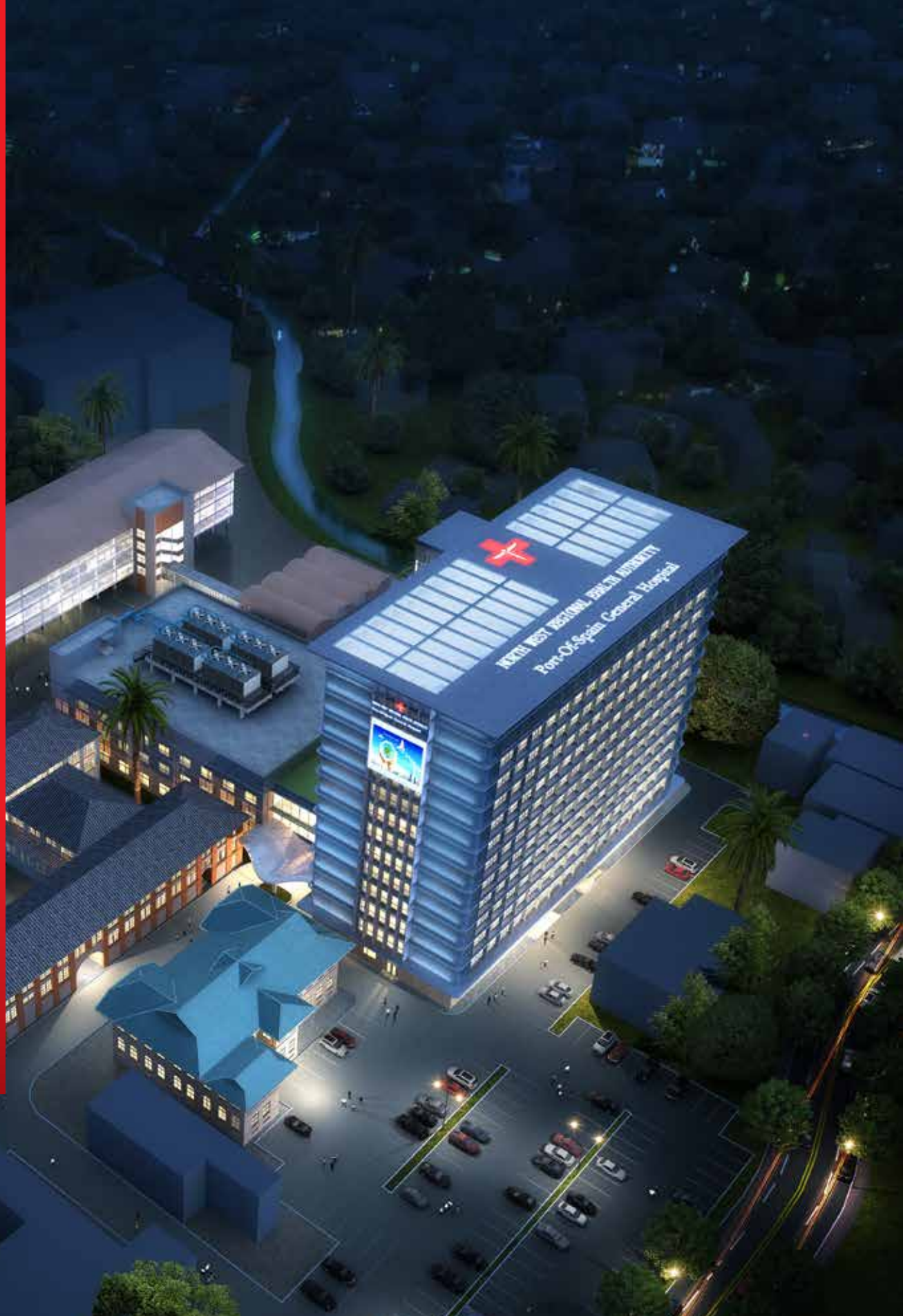
Render Image: Port-of-Spain Hospital Central Block