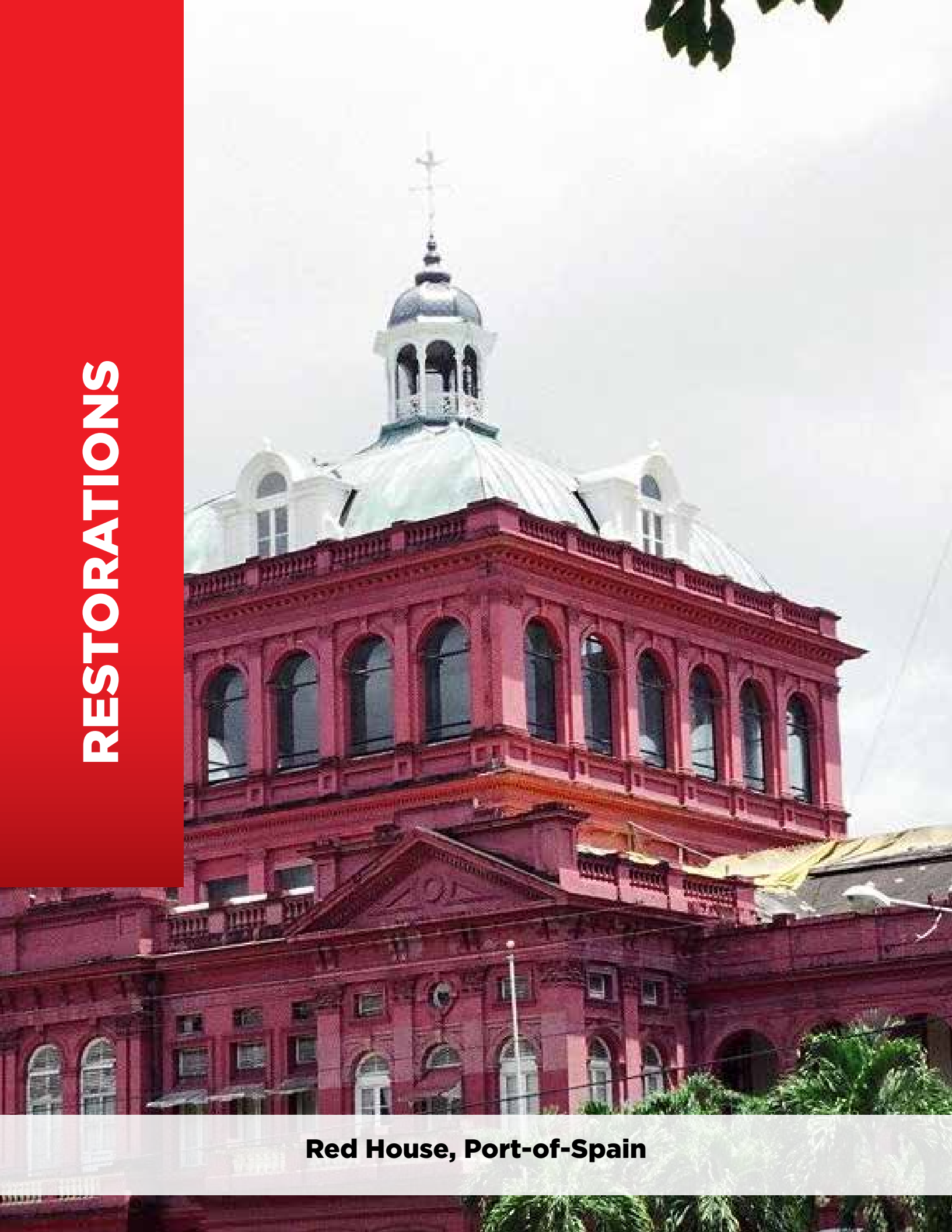
Red House, Port-of-Spain