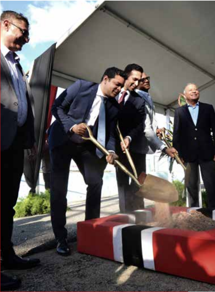
Skinner Park Sod Turning