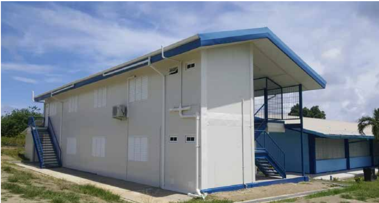
WHIM PRIMARY SCHOOL