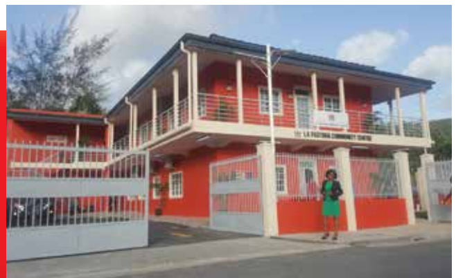
LA PASTORA COMMUNITY CENTRE